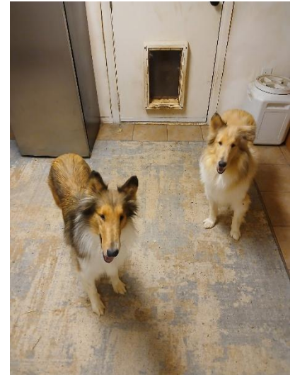
Fiona & Molly