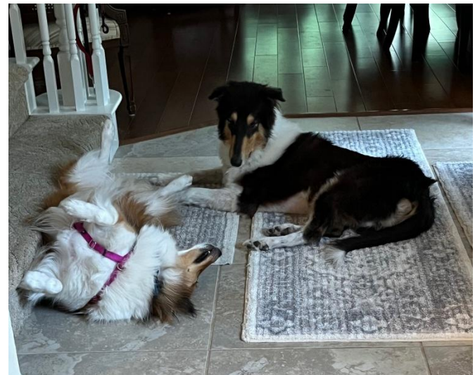
Toby (fostered by SSRI) with SSRI Penny